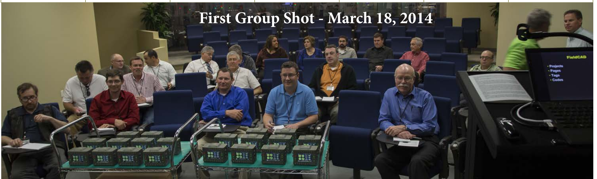
First Group Shot - March 18, 2014